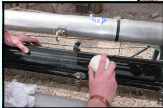
3. Buffing with spot pad