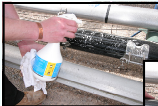
1. Easy Clean

Is a professional liquid cleaner for use on just about any kind of surface. It removes nicotine, grease, dirt, dust, salt and silicone.